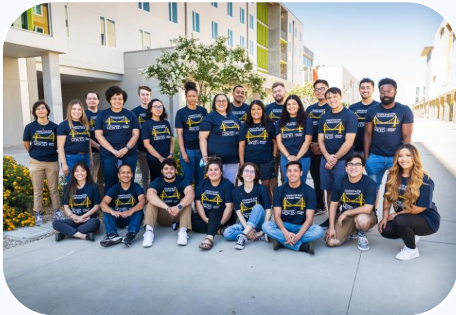
Graduate Division Fellowships and Summer Bridge Programs