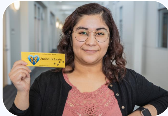
Services for Undocumented Students